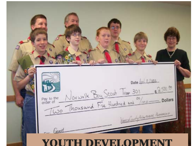
YOUTH DEVELOPMENT Norwalk Boy Scout Troop 301 New Trailer and Camping Equipment - $2,500