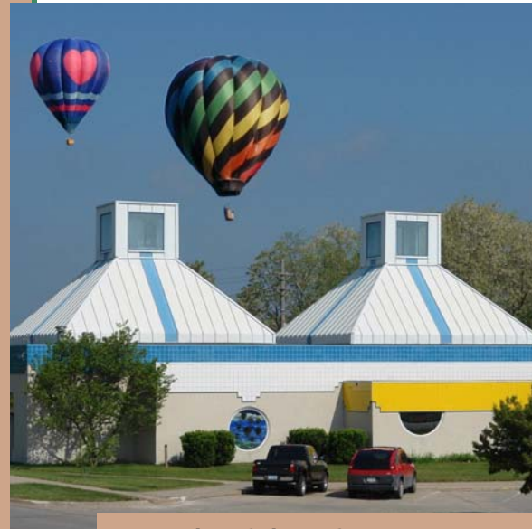
ARTS AND CULTURE National Balloon Museum Water Damage Repair Project - $2,000

Warren County Philanthropic Partnership's volunteer board is made up of representatives from throughout the county. The board is divided into 3 committees: an executive committee, a marketing committee, and a grant awards committee. The board is supported by the Warren County Economic Development Corporation . For a complete listing of current board members, visit www.wcedc.com/wcpp/ .